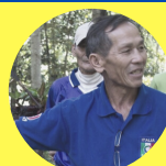
Garen Jengan Long Lamai Community